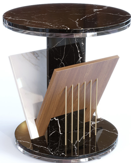
ACHILLE side table & magazine rack

Innovation inspired by the artisans who came before us, this forward-thinking design acts as a reminder of the elegant balance between practicality and luxury.