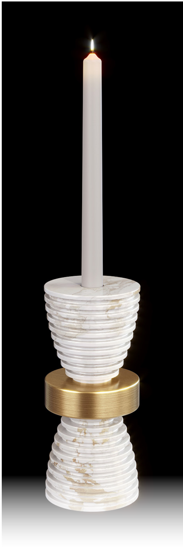
MUSE candle holder

Sleek and symmetrical, this timeless design breathes new air into the century-old reverence of marble.