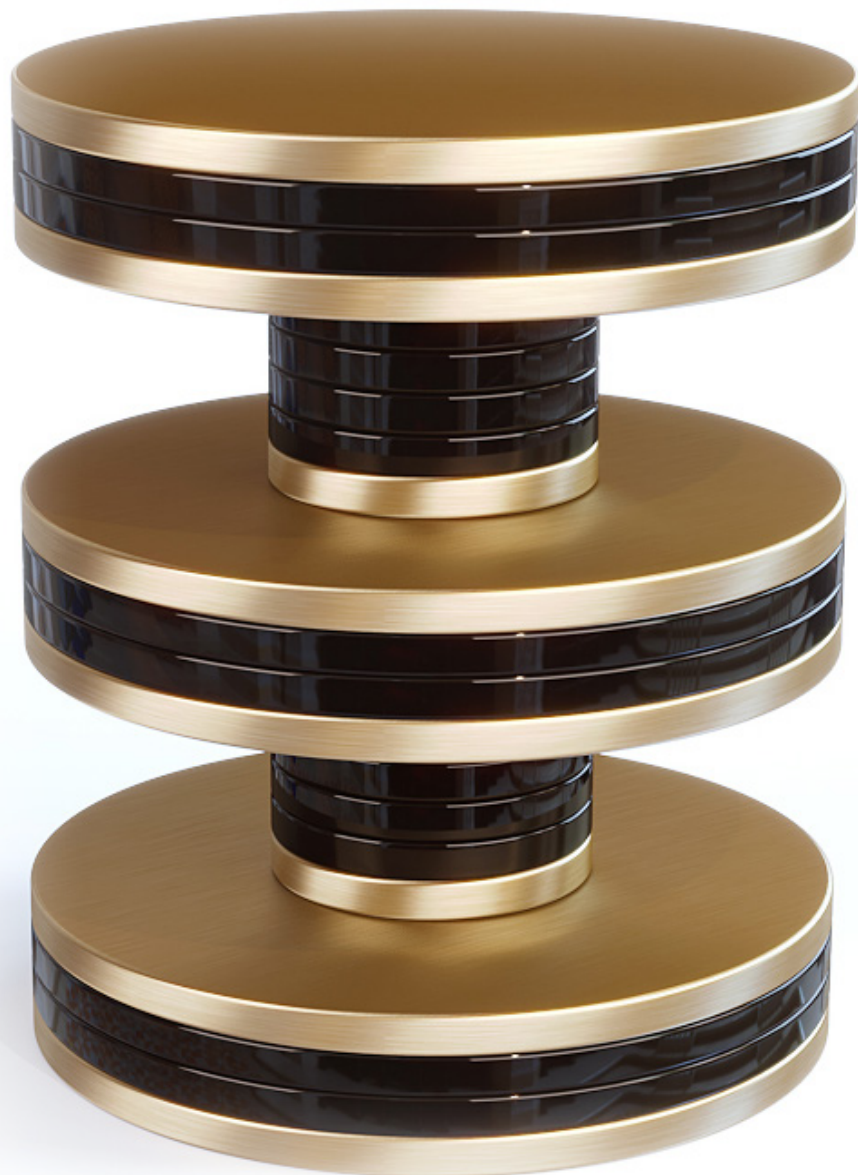
LODE end table

A manifestation of the multiple personas birthed out of the limitless combinations of layering varying shapes, sizes, and materials.