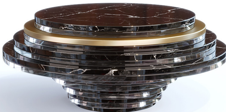
STADIO coffee table

The inanimate embodiment of mirroring personas. Made entirely with various sizes of round polished marble stacked with transparent acrylic glass and brushed brass accents.