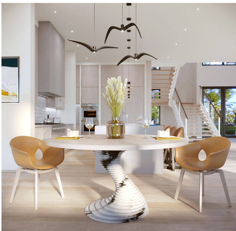
VENUS dining table

The Venus dining table features natural layers of cascading marble, creating curvatures and dimension at the base supporting a rounded tabletop.