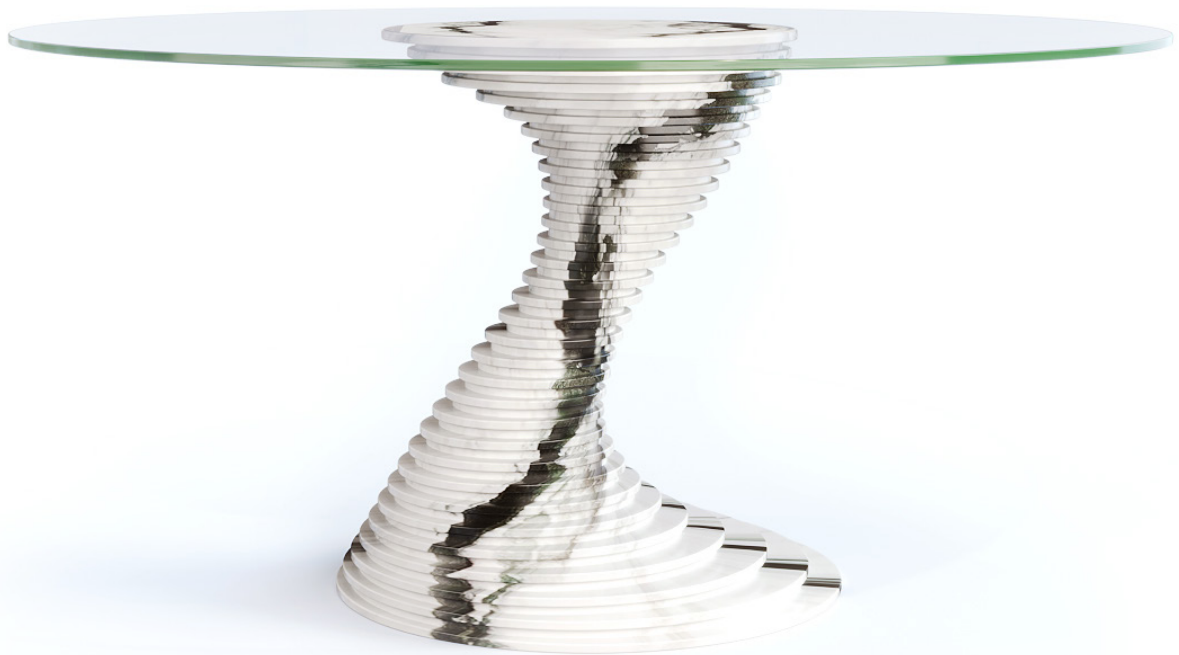
VENUS dining table